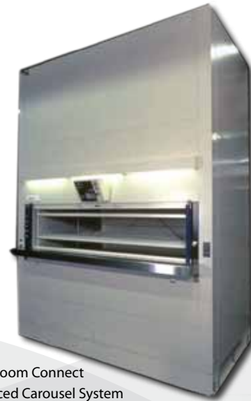
CleanRoom Connect Advanced Carousel System

CleanRoom Connect™ is a family of advanced vertical carousel systems that securely, efficiently, and intelligently stores and manages inventory as it enters and leaves a clean room environment. CleanRoom Connect provides an ideal portal for a wide range of applications, from healthcare facilities and medical device manufacturing, to semiconductor and electronics manufacturing.